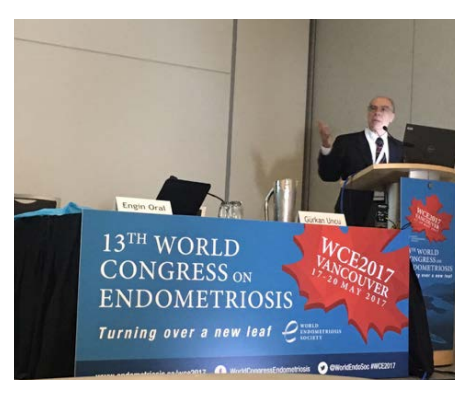
Survey Report: An online survey has been sent to all participants after WCE2017. Your course was rated 93% "Excellent or Good"; a total of 15 replies were received, out of which 14 persons rated the course with "Excellent or Good".)